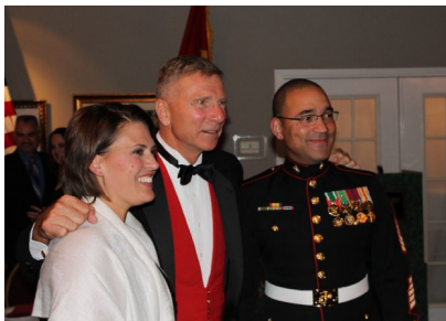
Former CMC, General Hagee and BVMCL Adjutant at Marine Corps Ball.

The Marine Corps League is headed by an elected National Commandant, with 14 elected National Staff Officers who serve as trustees. The National Board of Trustees coordinates the efforts of 49 department, or state, entities and the activities of over